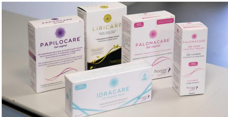
Illustration 1. Some of the products marketed by Procare Health

A laboratory focused exclusively on well-being and women's health, that offers treatments for gynecology, osteoarthritis and osteoporosis, but based on natural ingredients - plant extracts, herbs and fungi - without hormones, the great novelty at the time of their constitution.