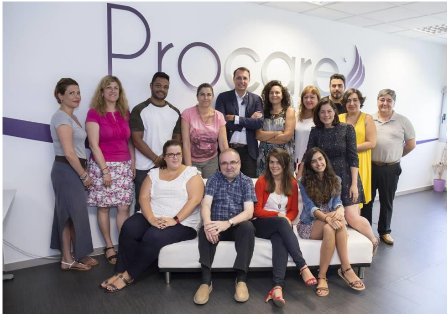
Illustration 2. The team, the company's capital, which has made the success of Procare Health possible

Created in 2012, this is how the idea of this pharmaceutical company arises, on the hardest year of the crisis, with a strong component of investment in R&D and an activity to which it dedicates 20% of its sales, it is a company close to four million euros in 2017.